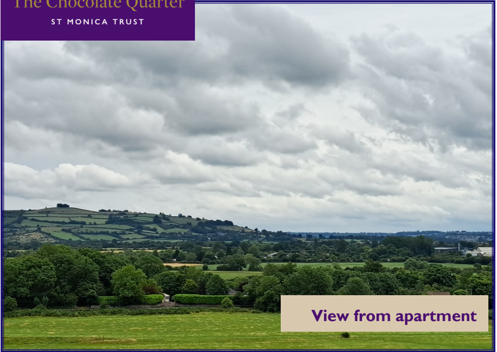
View from apartment