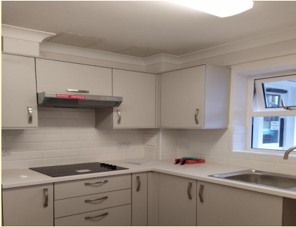
Example of new kitchen