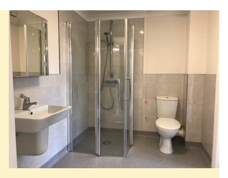
Typical shower room