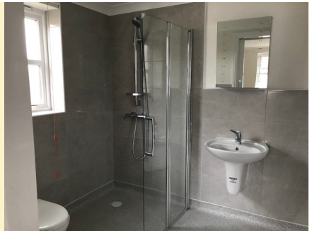
Typical new shower room