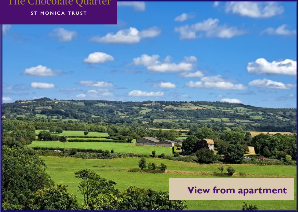
View from apartment