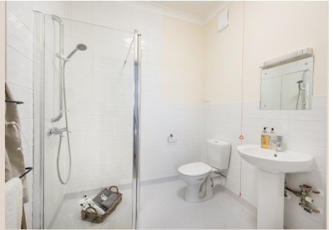
Typical new shower room