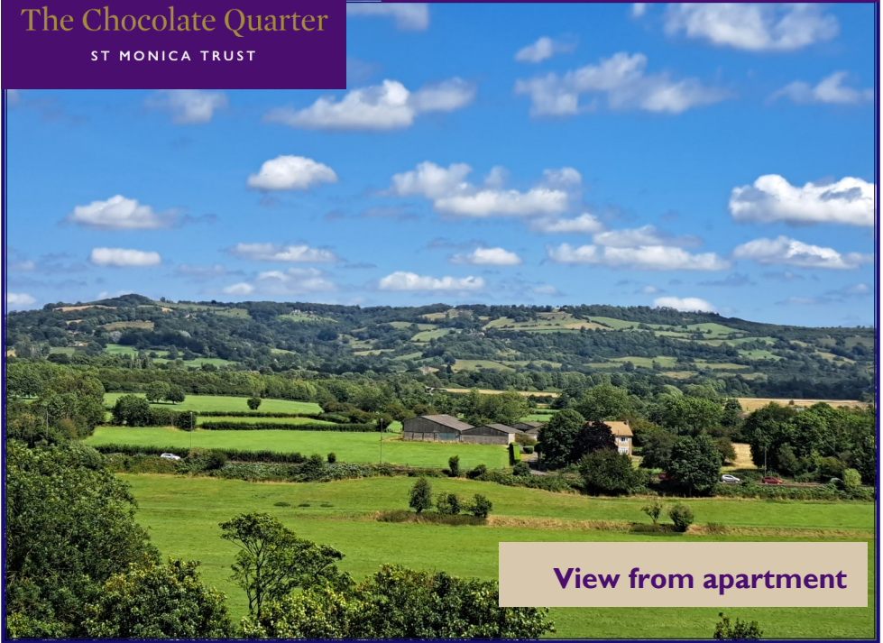
View from apartment